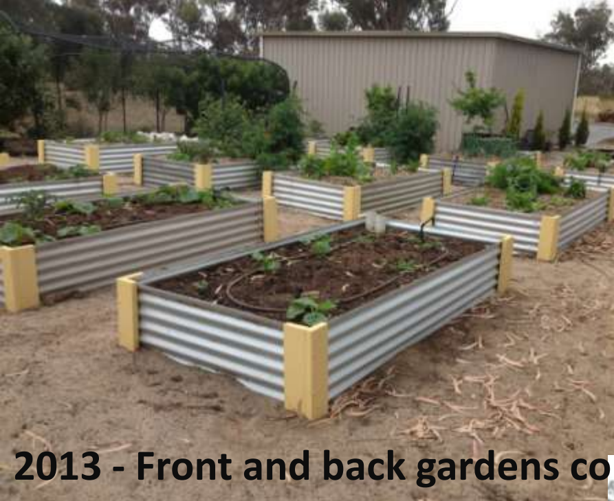
2013 - Front and back gardens complete.