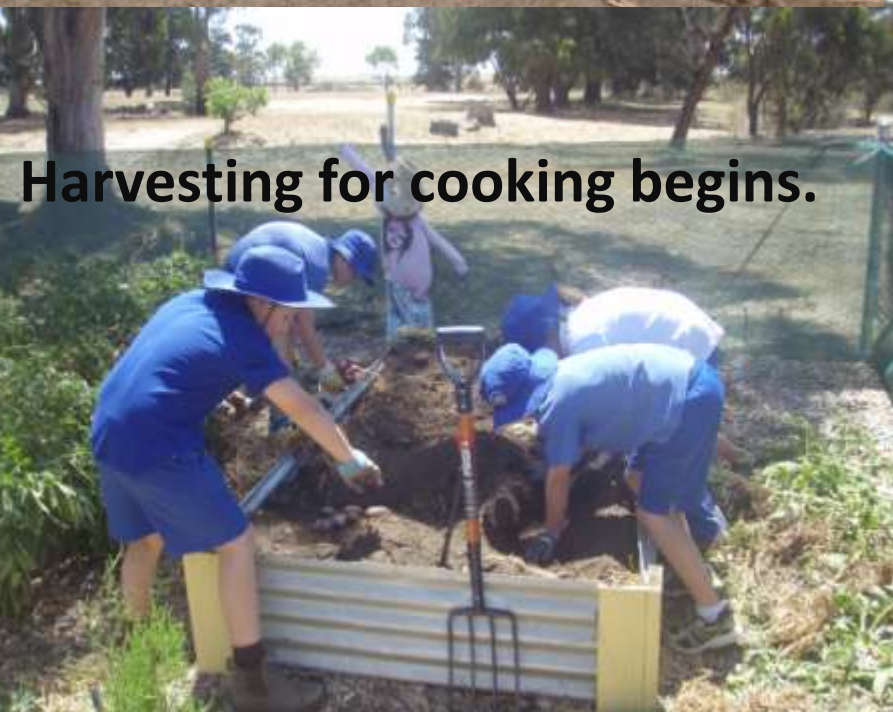
Harvesting for cooking begins.