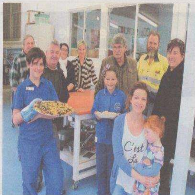
Cranbrook Primary School students and Parents and Citizens Council members with Cranbrook Community Men's Shed members at the school's new kitchen.

"I think it's fantastic what they have done for the school; the kids come home after school and they