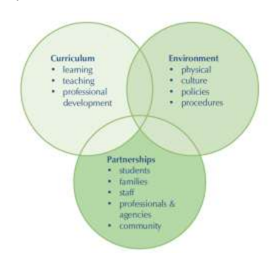
Diagram 1: The Health Promoting Schools Framework

The school ethos and environment considers the school policy and philosophical support for the health curriculum, approaches to health and wellbeing, school community relationships and the school's physical environment e.g. school grounds, canteen amenities.